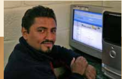
CBI MEXICO NORTH INSTRUCTOR

With willing hearts, over 5,000 men and women around the globe have joined with CBI to reach out in response to this call. Instructors, as we thank you, we echo again the words of Romans 10: "How beautiful are the feet of those who bring good news!"