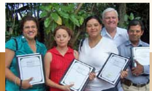
CBI NICARAGUA INSTRUCTORS