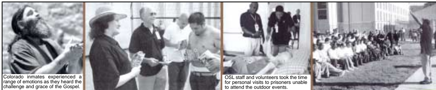
Colorado inmates experienced a range of emotions as they heard the challenge and grace of the Gospel.